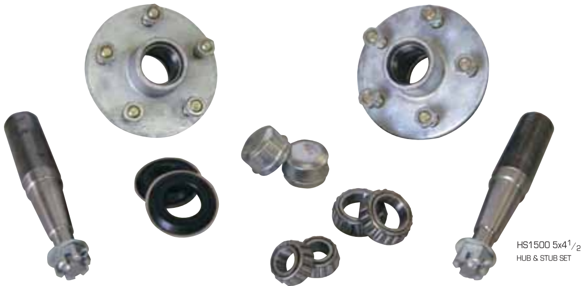
HS1500 5x4 1/2 HUB & STUB SET