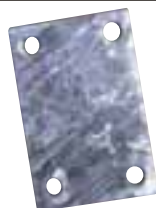
WR-PLATE (MOUNTING PLATE)