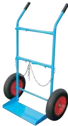
HT1515 - Heavy Duty Gas Trolley