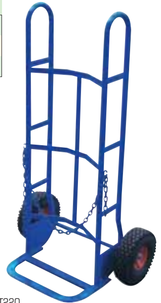
HT220 Single Bottle Gas Trolley