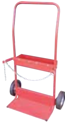
HT1418 Gas Trolley